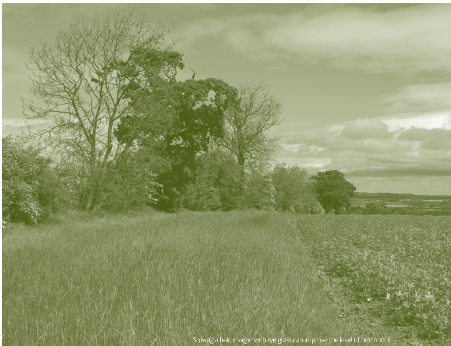
Sowing a field margin with rye grass can improve the level of biocontrol

A Rural Economy and Land Use Programme research project that investigates constraints on adopting alternatives to pesticides and ways in which these barriers may be removed.